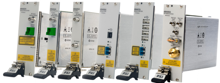
Challenge the Boundaries of Test Keysight Modular Products

Keysight Technologies, Inc. Optical eXtenders for Instruments can deliver your RF or Microwave signal without the power loss of coaxial cables, without the unwanted mixing products of downconversion techniques, and with the isolation of fiber at distances up to and beyond 1000 meters. Choose the combination of modules that best fits your requirements today with the confidence that you can scale the solution to meet the requirements of tomorrow by taking advantage of the modularity, scalability and upgradability of PXI.